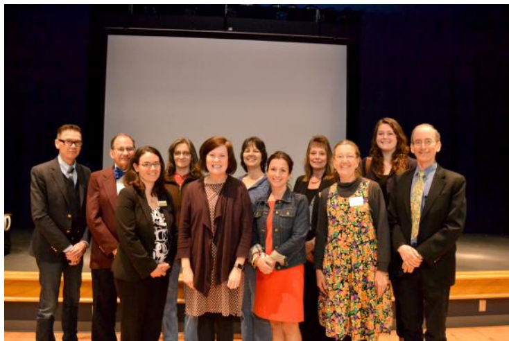
Speakers, presenters, and staff at the Children's Literature Conference