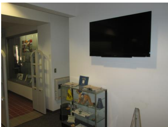
The new digital signage inside the library's main entrance/exit.