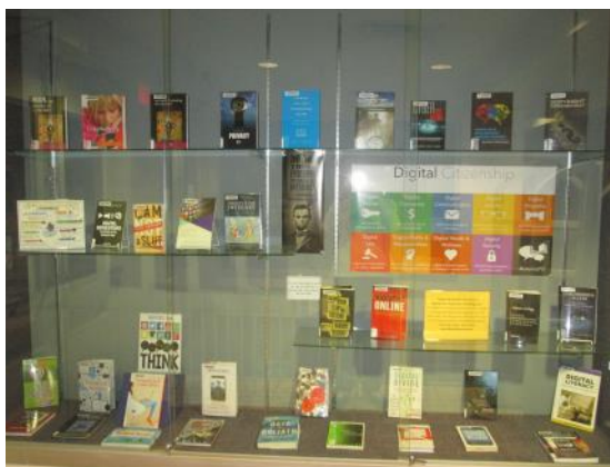
Kelly's exit display featured books about Digital Citizenship.

Jim Vikartosky and Kelly Bradish created the window displays inside the library's main entrance and exit for November through January.