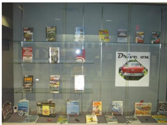
Jim's entrance display featured books about cars and driving.