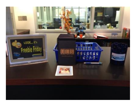
Free stuff on Freebie Friday

Fridays at the Millstein Library are now "Freebie Fridays." A variety of free ULS-branded items will be available for students to pick up at the information desk. Don't forget to stop in this Friday!