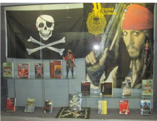
exit display featured items about pirates, real and fictional.

Bonnie Chambers created the window displays inside the library's main entrance and exit for the months of February and March.