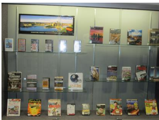
The entrance display featured materials from the Millstein collection about Pittsburgh while the