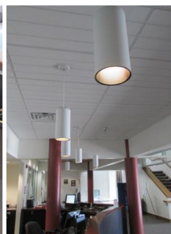
The adjusted overhead lights