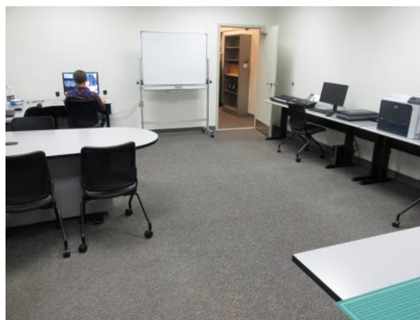
The expanded digital media lab and equipment storage room.

To accommodate the expansion, the former stereo room has been converted into a storage room for all of the digital media lab equipment. For easier access, a door has been added connecting the digital media lab to the equipment storage room.