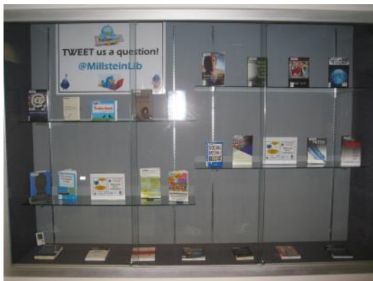
Amanda Folk's displays featured books on social media, including Twitter, Facebook, and music.