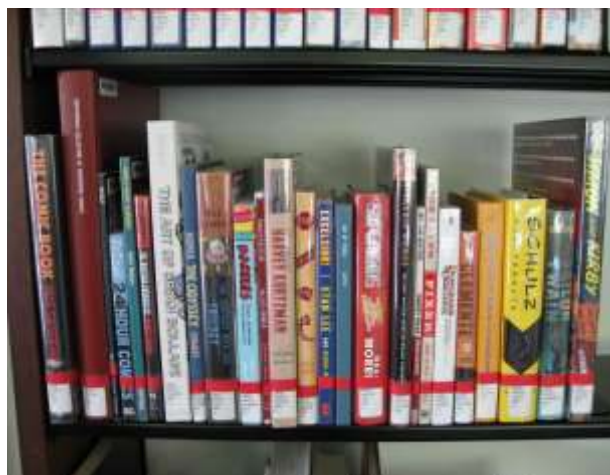
Graphic novels have red stickers to identify their shelving location.