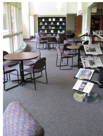
Visit the updated current periodicals room today!