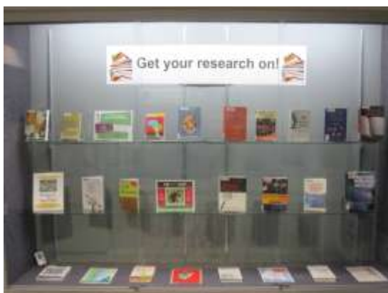
Amanda Folk's display featured books about higher education and library research.