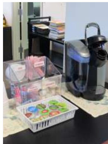
Coffee for sale at the Information Desk