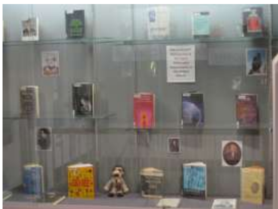
Jim Vikartosky's displays featured philosophy books from classic works to pop-culture.