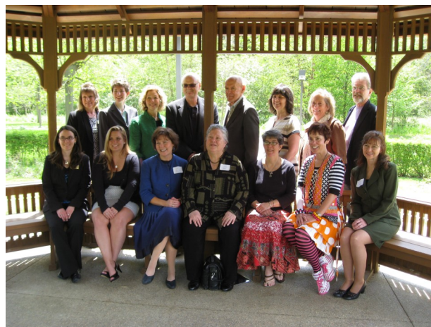
Authors, presenters, and library staff at the 2011 Children's Literature Conference

Richard Peck and Jim Aylesworth also signed copies of their books for conference attendees at the end of the day's events.