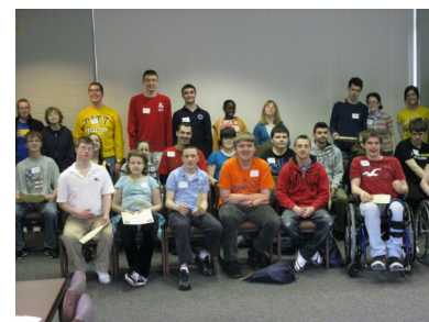
Clelian Heights students receive their certificates of completion at College Day.

"goody bags" given to each Clelian Heights student. The students received a completion certificate at the end of the day.