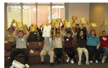
Students from Clelian Heights celebrate after completing their activities at the Millstein Library

(SPSEA) planned and sponsored the event.